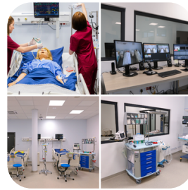
Monoprofile Medical Simulation Centre